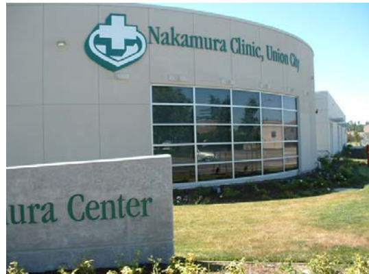
The Nakamura Clinic