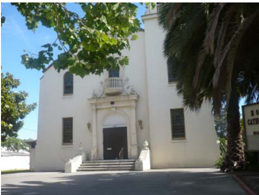
The new St. Anne Catholic Parish on Dyer/Cabello Street.