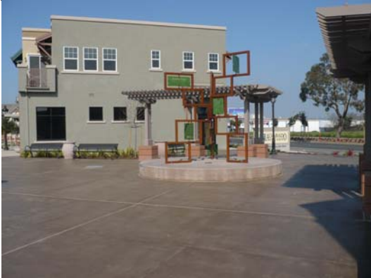
Alvarado Square in the Old Alvarado district.