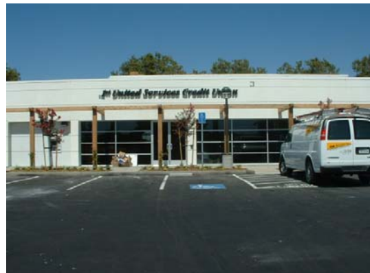
1st United Services Credit Union