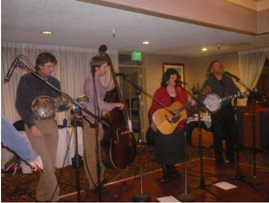
Live bluegrass band