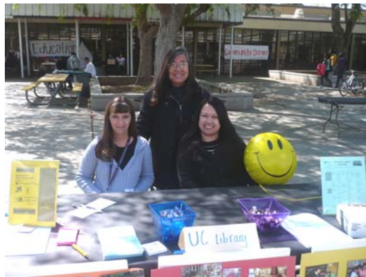
Union City Library Table