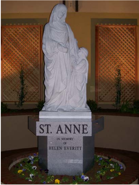
St. Anne Prayer Garden