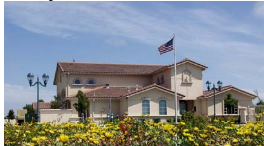
Station #4 on Eastin Ct.

Top of the line features of this new Fire Station are: Lobby, Apparatus Bay for two units, spacious day room, dining room, four dormitories, men’s locker room, turnout room, laundry room, patio with barbecue, health screening room, Captain’s Reception Room, nine storage areas, phone booth and community meeting room.