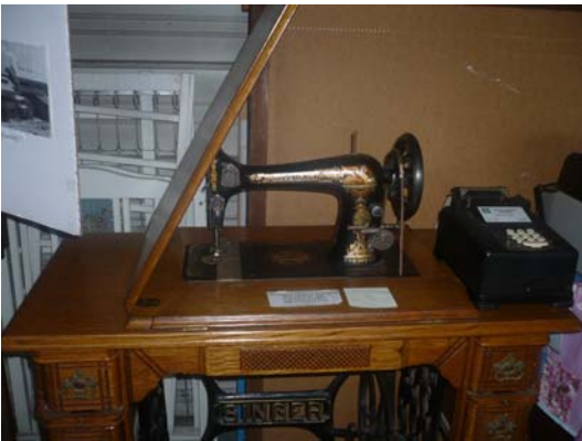
An old Singer sewing machine

The displays are housed, fittingly, in Union City's first firehouse.