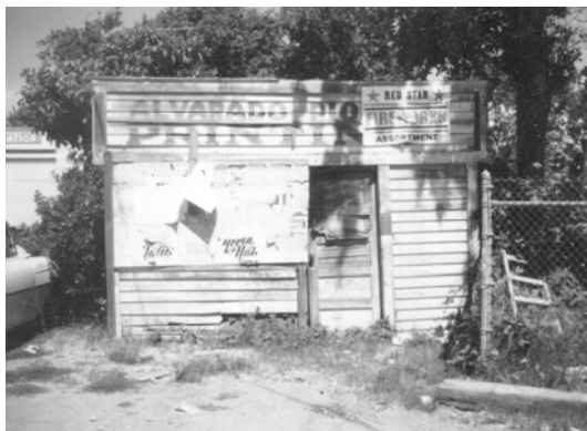
Alvarado Print shop