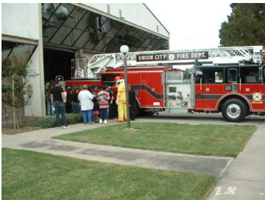
Station #1 on Central Ave.

Chief Maxwell oversaw four fire stations with 47 uniformed “Line” personnel and a $7.9 million annual operation budget. The Fire Station are #1 located on Central Ave., Fire Station #2 on Alvarado Blvd., and Fire Station #3 on 10 th Street. The newest fire station is Fire Station No. 4 located on Eastin Ct.