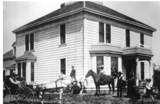
McKeon House 1890